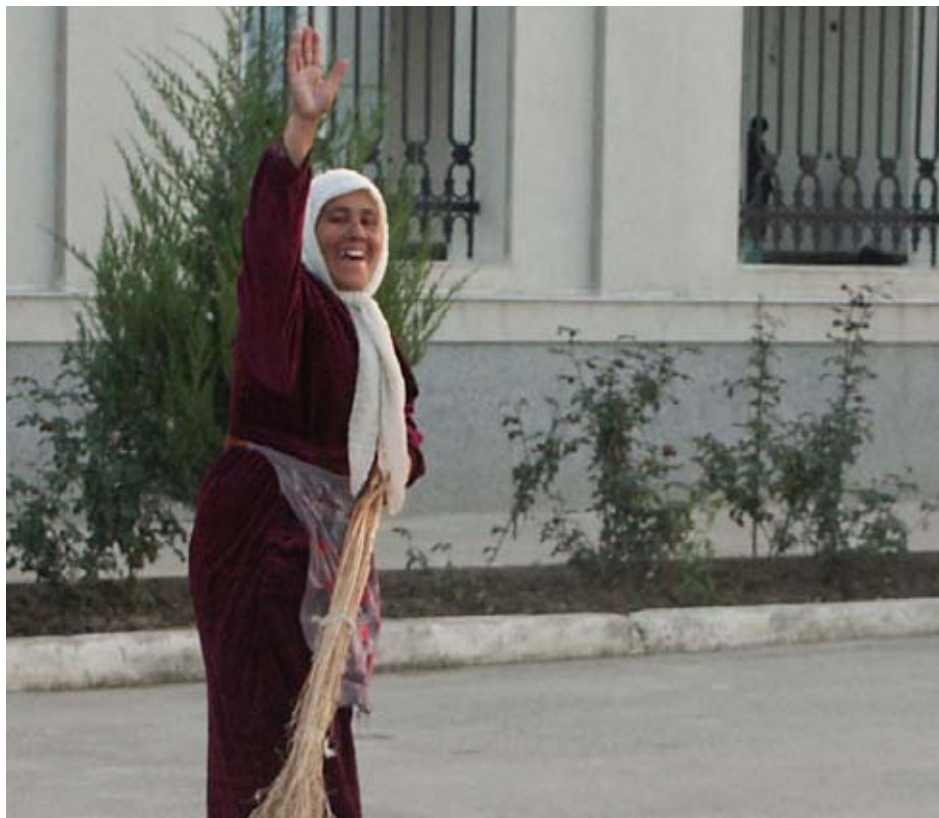
Uzbekistan

This is an illustration of woman's protection by the religion in a material, physical and moral way. Women just should know their rights and fight for them. They can significantly improve their lives if they are aware of the religious canons. Besides, a little bit of courage and firmness in fighting for their rights would be good. Because the Koran also says: "God does not like those who obey the oppression".