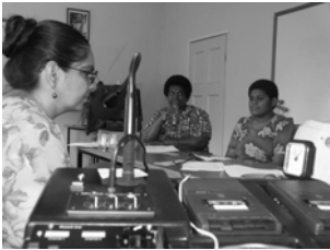
(left) Regulars on air the FDPA women's group

The field tests eventuated with the additional support femLINKpacific received from UNESCO, who assisted femLINKpacific purchase the equipment and also provided a follow IPDC grant for follow up training and community radio consultations: