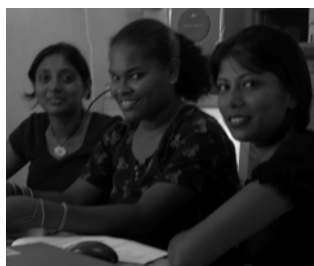
Right: The FRIEND broadcast team ...on air during our first broadcast in the western division, January 22 2005

Following the November training, local broadcasts have been staged in Navua and Lautoka, and an intense week of consultations in Labasa: