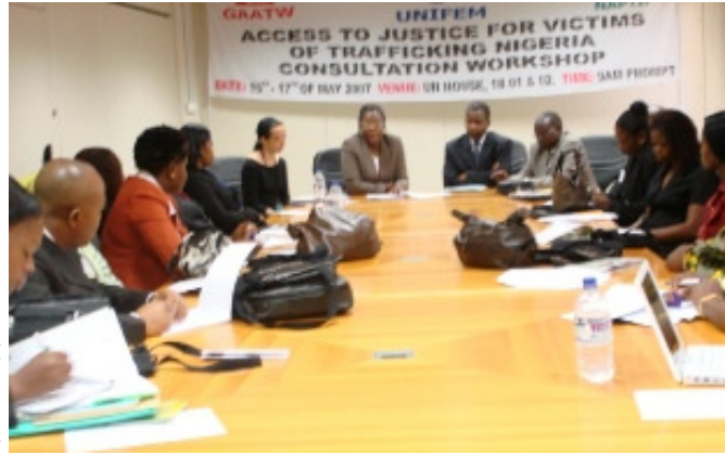
Participants at the workshop

Two survivors shared their experience and their anxieties thereby providing an invaluable chance for all the participants to understand