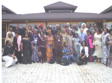
Group Picture of the Women in Governance Summit

Participants for the summit were made up of female federal and state legislators, deputy governors and ministers as well as the female commissioners from Cross River state.