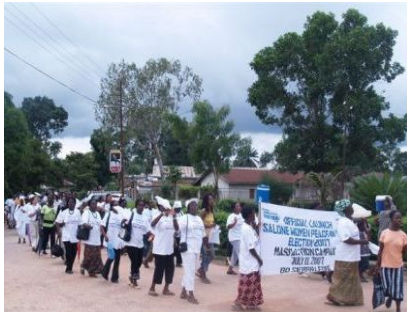
Sierra Leone Women Peacekeepers Campaign for 2007 Election

The non-partisan mass action campaign was launched with a peaceful march through Bo Town, and for the next month the partici-