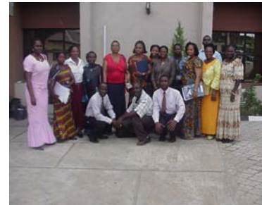
UNIFEM training workshop participants

The Workshop was attended by two representatives of each implementing organisation; Afro Centre for Development of Peace and Justice (AFRODEP), Development Alternatives (DEVIN), Community Partners for Development (CPD) and Youth for Technology Foundation (YTF) and two members each of Local Management Committee and one member of the Women Development Centre of each local government with a total of 18 people.