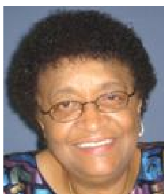
Liberian President Ellen Johnson-Sirleaf, the first female head of state in Africa

Although Johnson Sirleaf was not present at the 30 th Anniver-