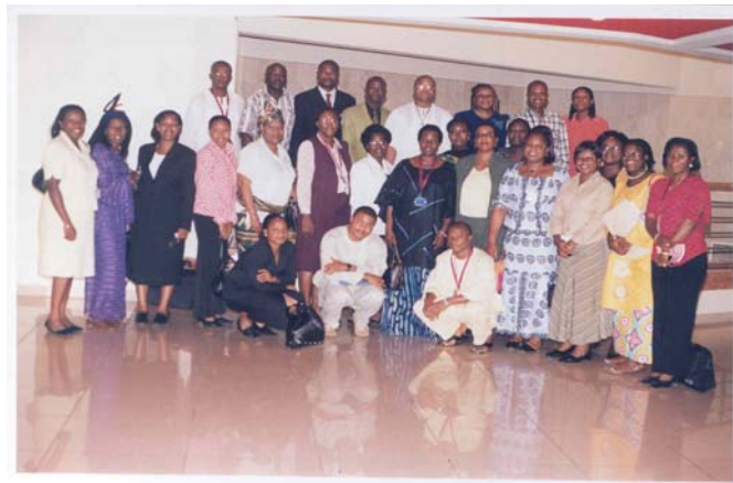
Attendants of this year's meeting at the UN House in Abuja

Although this project has not come without major challenges due to the location of the com-