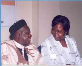
Florence Butegwa, UNIFEM Regional Programme Director and former minister of Federal Capital Territory, Engr. Abba Gana

ture, water, transportation, inefficient and ineffective use of scarce resources, the promotion of the exchange of ideas, tools, models and best practices among partners. It seeks to accomplish this while reducing transaction costs in the delivery of gender initiatives and interventions and strengthening links and mechanisms for improved cooperation between government, civil society groups and other actors. Visit www.gendernigeria.org