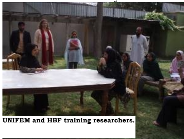
UNIFEM and HBF training researchers.