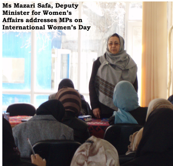
Ms Mazari Safa, Deputy Minister for Women's Affairs addresses MPs on International Women's Day

The event was opened by Ms Mazari Safa, Deputy Minister for Women's Affairs who spoke about MoWA's aim to create a secure environment for women outside of the home. The group of 6 NGOs, identified five areas where